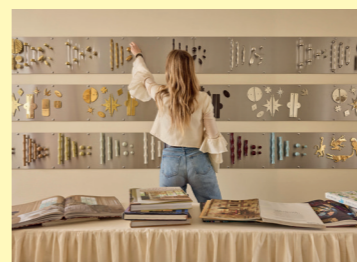
MG&Co. scent-filled collaboration 18-24 May

Tomtom will be launching a vibrant summer menu with floral-inspired dishes and refreshing drinks, celebrating the season's colour, freshness, and uplifting flavours.