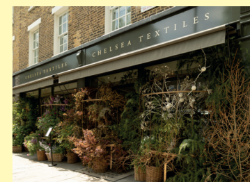
Chelsea Textiles 18-24 May

Morena will be offering honeycomb ice cream with fairy dust and orange blossom matcha.