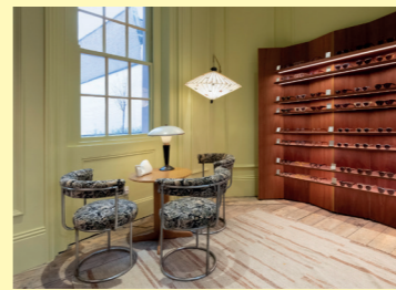
Cubitts 18 - 24 May

All customers buying a full-sized product in-store during Belgravia in Bloom will receive a complimentary gift with purchase sample bag.