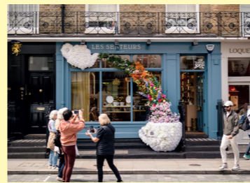
Les Senteurs 18 - 24 May

Chelsea Textiles will be holding a special promotion on its exquisitely hand-embroidered Tree of Life cushions.