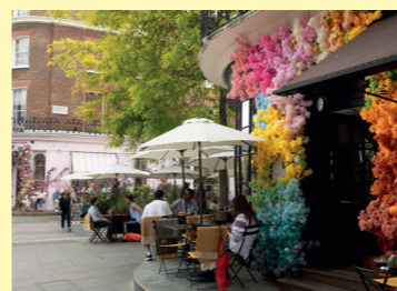
Tomtom Coffee special menu 18 - 28 May

Soak up the sun for a little bit longer whilst late-night shopping in Belgravia on 19 May as retailers stay open after hours.