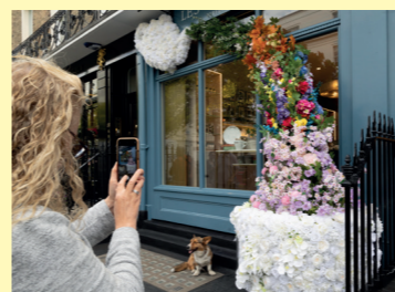
Vote for your favourite display 19 - 24 May

Take part in a public vote for the best floral installation at Belgraviavillage.com . The winner will be announced on Instagram @Belgraviavillage on Tuesday 26 May.