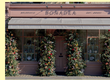
Bonadea's sensory journey 18 - 24 May