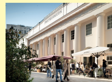
Enjoy late night shopping 19 May

Visit our shops and restaurants at their prettiest time of year, across Belgravia Village, The Pimlico Road and Motcomb Street.