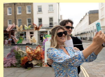
Take a selfie with the installations 18 - 24 May

Take part in a public vote for the best floral installation at Belgraviavillage.com . The winner will be announced on Instagram @Belgraviavillage on Tuesday 26 May.