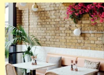
Morena special menu items 18-24 May