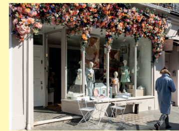
Activities at Pepa London 18 - 24 May

In celebration of Cire Trudon's UK launch of an enchanting Figuerie collection, Bonadea invites guests to embark on a sensory journey through the world of Trudon fragrance.