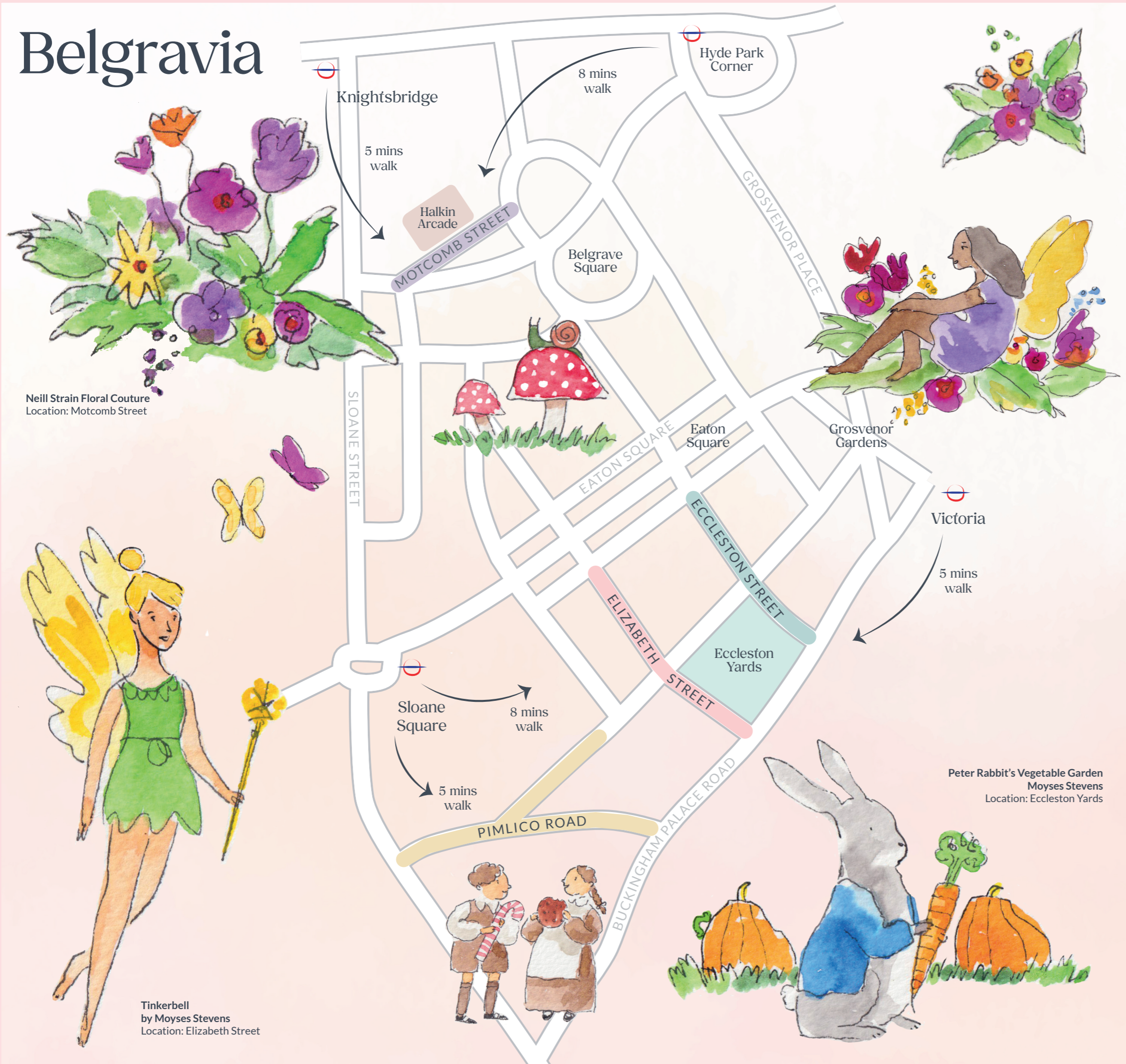
Neill Strain Floral Couture Location: Motcomb Street